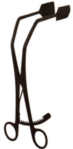
Gynecology Laser Surgery