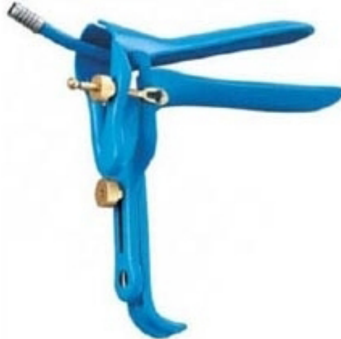
Gynecology Laser Surgery