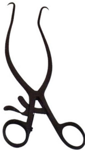
Gynecology Laser Surgery