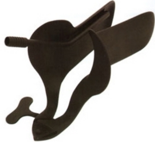
Gynecology Laser Surgery