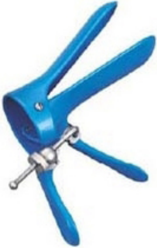
Gynecology Laser Surgery