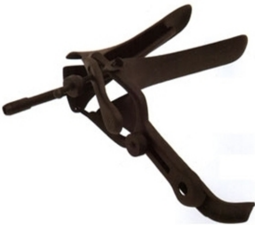
Gynecology Laser Surgery